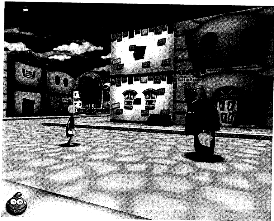
Fig. 2 ToonTown: A Toon encountering a Cog in ToonTown

The escort quest is a quest which requires a player to escort an NPC from one area to another. This often involves strategic planning by coordinating